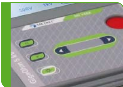
Straight forward and fast test adjustment