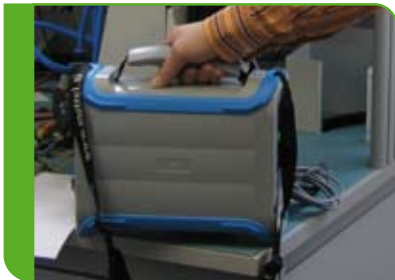
Handle and shoulder strap make the unit easy to carry