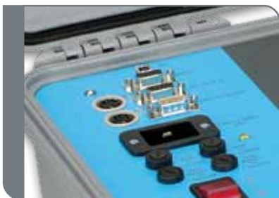
Inputs/outputs for manual or automatic settings.